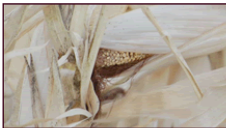
Corn at Termuende, December 2, 2011.