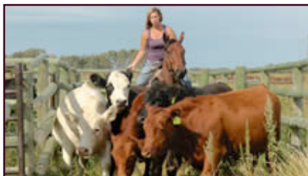
Steer weigh day, August 2011.